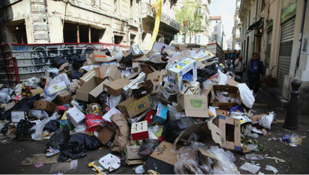
A street in Marseille, France, March 2017