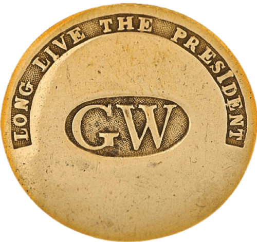
Campaign button for George Washington

MA Design Studies, Parsons School of Design