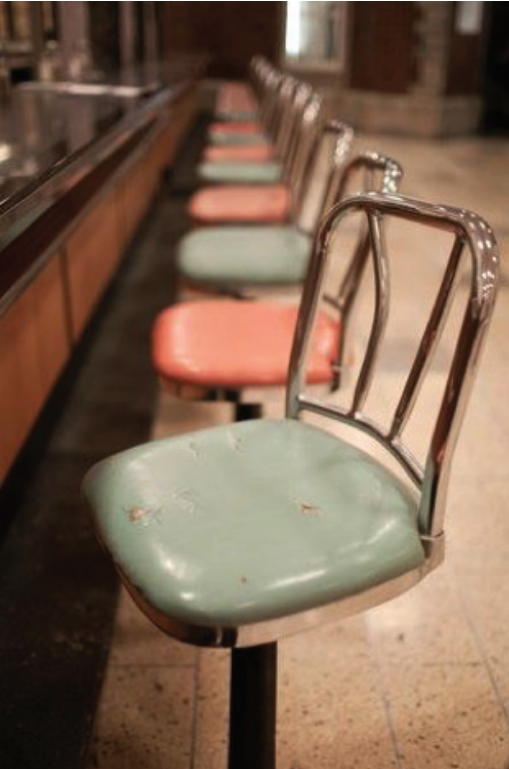
Woolworth Lunch Counter Stool.